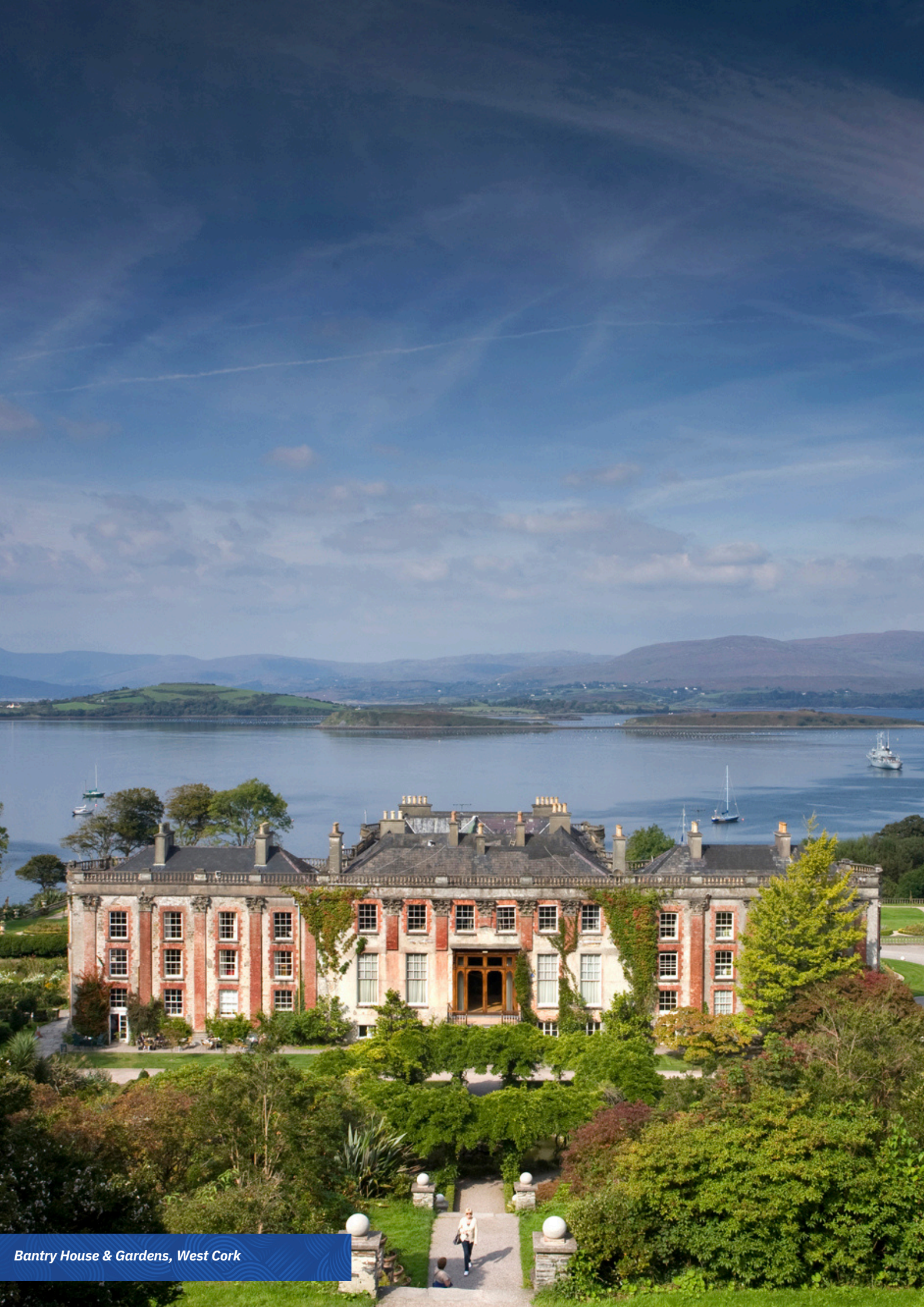
Bantry House & Gardens, West Cork